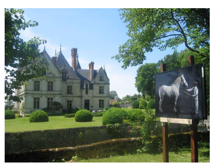
La Bourdaisière, Montlouis/Loire, May 2004